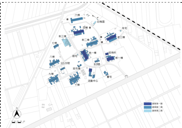
Figure 4. Configuration diagram of building level classification of Jianguo Military Dependents' Villages II

The research objective is to conduct a research on changes in the space and use pattern of “ruins of military housing villages” in order to explore the evolution of how residents in Taiwan used different types of Japanese colonial war-remained facilities and converted them into living spaces during the military housing community period. For redeveloping with ecovillage strategies, the research scope was extended to the correlation of the evolution of the space of the ruins of military housing communities, the 39 retained buildings, and agricultural environment [8].