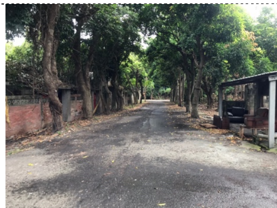
Figure 2. status of Jianguo Military Dependents' Villages II