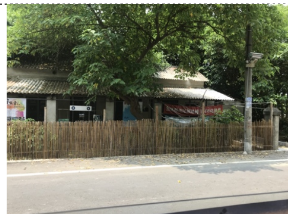
Figure 1. status of Jianguo Military Dependents' Villages I

Jianguo Military Dependents' Villages in Huwei, Yunlin County were built in 1943 under Japanese colonization. After World War II, military family-built extensions into the original buildings and organically transformed to liveable space. Jianguo Military Dependents' Villages were related to the Japanese troops' war readiness relics in Taiwan were preserved in the name of "military housing community culture preservation". The Japanese colonial war-remnant facilities intended for residential use by the military housing communities had the dual identity of "relics" and "military housing community". Jianguo Military Dependents' Villages were scattered villages and village I and village II were preserved to be cultural heritages, since village III transformed as an elementary school and village IV are now a prison (see the figure 1.2.3.4.). The condition of unique culture and rural agricultural environment provide the opportunity for Jianguo Military Dependents' Villages to redevelopment as a ecovillage demonstration in Taiwan.