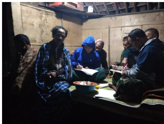
Figure 2. Pos Ronda Activities at the Alert Level in Kali Tengah Lor Hamlet, Glagah Harjo Village, Cangkringan District (Radius 3 km from Merapi)

The frequency of answers agrees to have an answer percentage of 42.14%, which means that less than half choose to agree. And the frequency of answers strongly agrees to have an answer percentage of 42.61%, which means that less than half choose strongly agree. These two frequencies are taken by the 45 community groups downwards, with various levels of education. This indicates that not the main education, but the mindset of the young generation is more positive in the future than backward