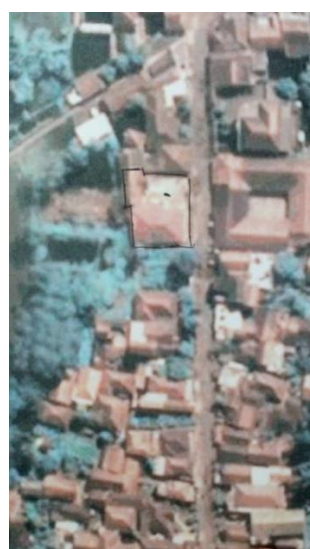
Figure 2. This figure is delineated by one of the officers, before training

Two delineations and interpretations of the boundary of village office were carried out by two village officials. The results of the manual calculation of the extent of each parcel boundary interpretation have a quite different value. Figure 2 has a parcel area of 474 m 2 while Figure 3 has an area of 306 m 2 .