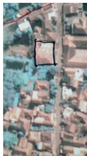
Figure 3. This figure is delineated by another officer, after training