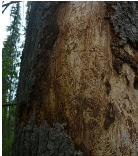
Figure 4. Spruce old dead standing trees with the presence of bark beetle mines.