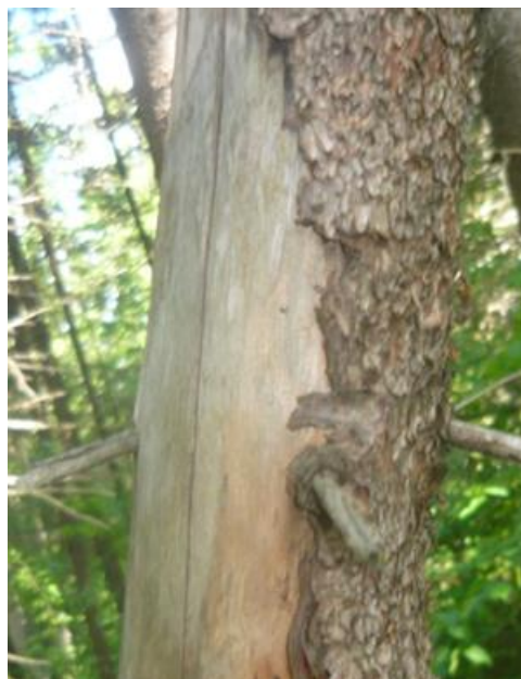
Figure 5. Spruce old dead standing trees without the mines of bark beetle.

Thus, the results obtained by us disprove the opinion of the majority of scientists about the impact of the bark beetle on the drying spruce forests. It is necessary to conduct complex investigations to determine the reasons of the drying spruce stands. It is necessary to attract various specialists, it is necessary appropriate financing.