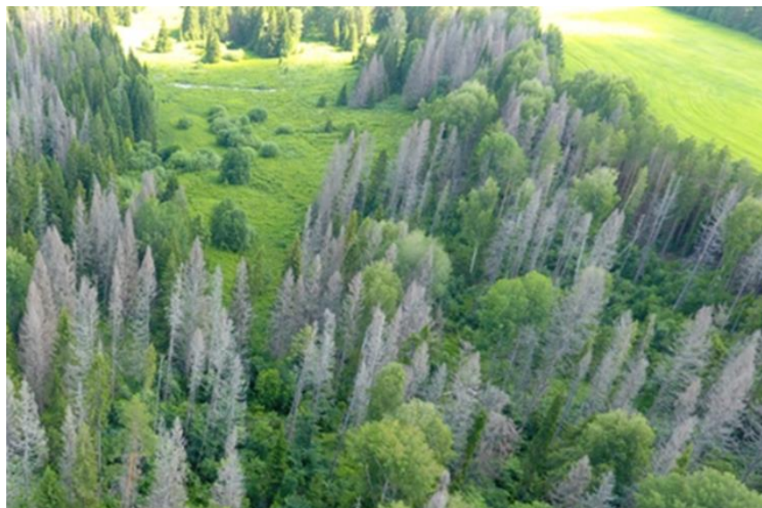
Figure 1. Spruce forest drying in Permsky Kray.

to study the reasons of spruce stands drying in last years in the territory of the Permsky Kray [11]. This fact determined the line of our research.