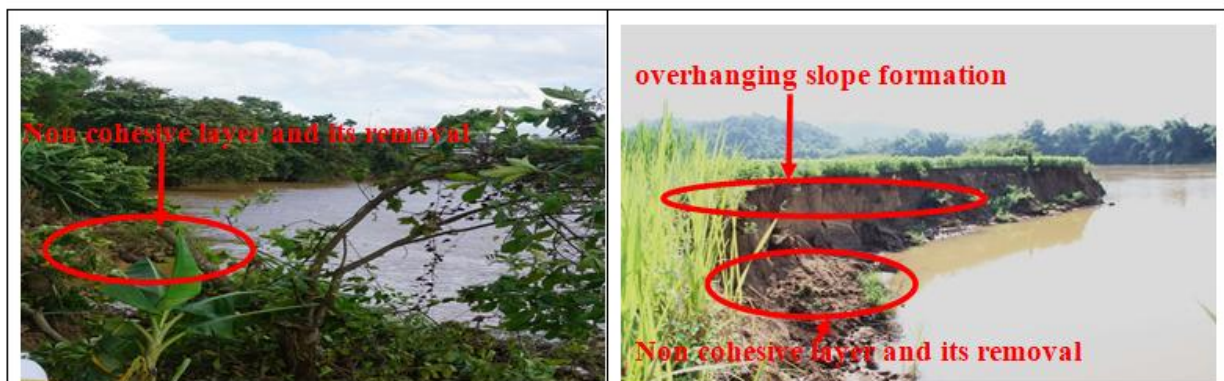
Figure 2. Cohesive and non-cohesive layers at Dong Nai River.

Under cutting or loss of underlying support is the primary cause of bank erosion at Dong Nai River. As a result of hydraulic action, the soil particles of underlying layer is detached and carried far away by stream flow which results in overhanging layer at the top. This overhanging layer with time collapse and execute rapid bank erosion.