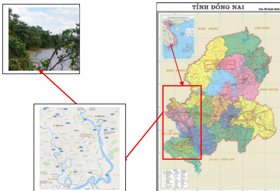
Figure 1. Location of bank erosion in Bien Hoa – Dong Nai.

Bien Hoa City is located in the west of Dong Nai province, borders Vinh Cuu district in the north, Long Thanh district in the south, Trang Bom district in the east, Di An town, Tan Uyen district of Binh Duong province and District 9 of Ho Chi Minh in the west. Bien Hoa City has a total area of about 263,55 km 2 .