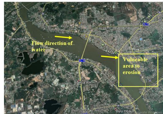
Figure 5: Vulnerable sites of bank erosion at Buu Long - Bien Hoa.