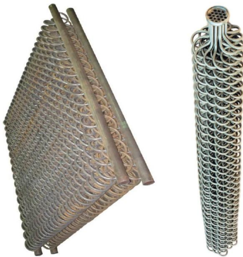
Figure 1. Sections of twisted coil (SRBT) in various options.

a design of the heat exchange surface not only increases its area, but allows increasing the intensity of heat exchange due to high turbulence of the medium flow along the intertubular and in-tube flow channel spaces. The second advantage of SRBT is self-compensation of temperature deformations during rapid heating and cooling conditions. This type of heat exchanger is designed to work in any liquid and gaseous mediums. Another feature of twisted SRBT heat changers, important for heat treatment of high paraffinic oils, is the self-cleaning by to high turbulence of flows in both flow channel spaces, preventing deposition and accumulation of wax, as well as the possibility of safe rapid cleaning of the SRBT surfaces by thermal hydro shock. The variants of block-modular execution of heat exchangers makes it possible to optimally select the desired temperature regime and performance, and the high throughput of twisted pipes due to the creation of vortices and turbulization of flows eliminates the loss of productivity because of growth of hydraulic resistance . The option of vertical layout does not require a large area, it also facilitates access to internal surfaces for maintenance, allows for full air removal, draining and cleaning by own staff.