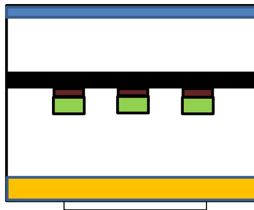
Figure 2. Front view of the hybrid system