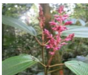
Figure 11. Tampar badak ( Pogonanthera pulverulenta Blume)