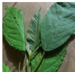
Figure 4. Latong ( Litsea leefeana )