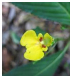
Figure 8. Sibagori ( Sida rhombifolia )