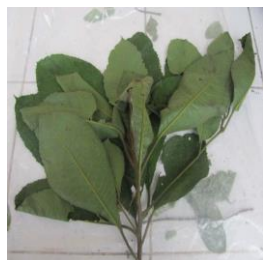
Figure 6. Ruam ( Flacourtia rukam Zoll. & Mortizi)