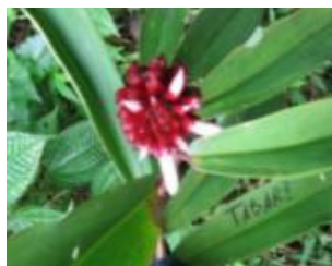
Figure 10. Tabar-tabar ( Costus speciosus Sm.)