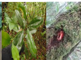
Figure 5. Modang / Modang Londir ( Persea rimosa )