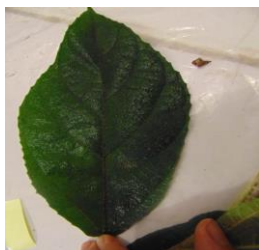
Figure 2. Dong-dong ( Laportea stumulus Gaud)