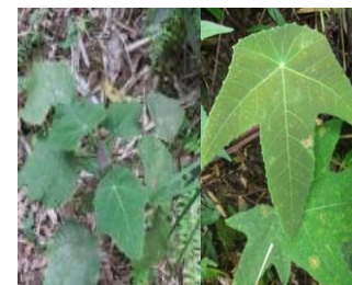
Figure 9. Sitarak ( Macaranga gigantea )