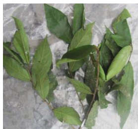
Figure 7. Rube ( Ficus lowii King.)