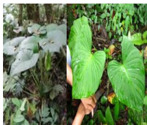
Figure 3. Langge ( Homalonema propinqua Ridl).