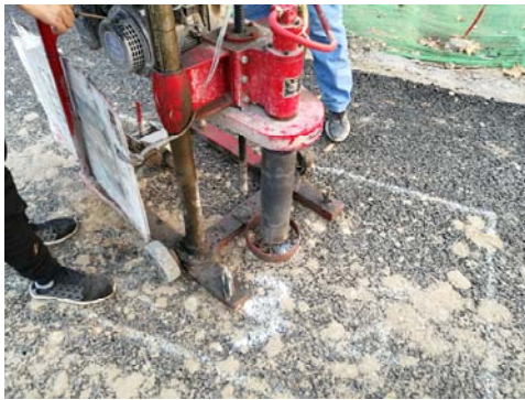
Figure 3. Core Drilling and Sampling

Before detection, the GPR wave was processed by two-dimensional filtering such as static correction of moving start time, gain adjustment, de-DC drift and Butterworth band-pass, extracting average channel and sliding average, so as to suppress and eliminate interference wave, highlight effective wave, and finally obtained effective data. In order to achieve better detection effect, radar detection profiles were arranged along the driving direction of the test section to satisfy the effective detection of the test area. The field work is shown in Figure 4 below.