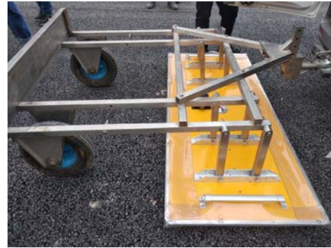
Figure 4. GeoScope MK IV