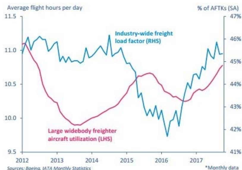
Figure 1. Air traffic in Jilin Province, 2012-2017

2.3.2. E-commerce market share and air express proportions continue to increase. As of 2017, Jilin Province's e-commerce sales achieved three-digit growth for three consecutive years. As the core link of e-commerce, the proportion of express logistics in aviation logistics has also increased year by year. According to statistics, in 2015, Changchun Longjia Airport's cargo composition, the most is the air express, which has accounted for the total amount of airport freight. More than 70% [3].