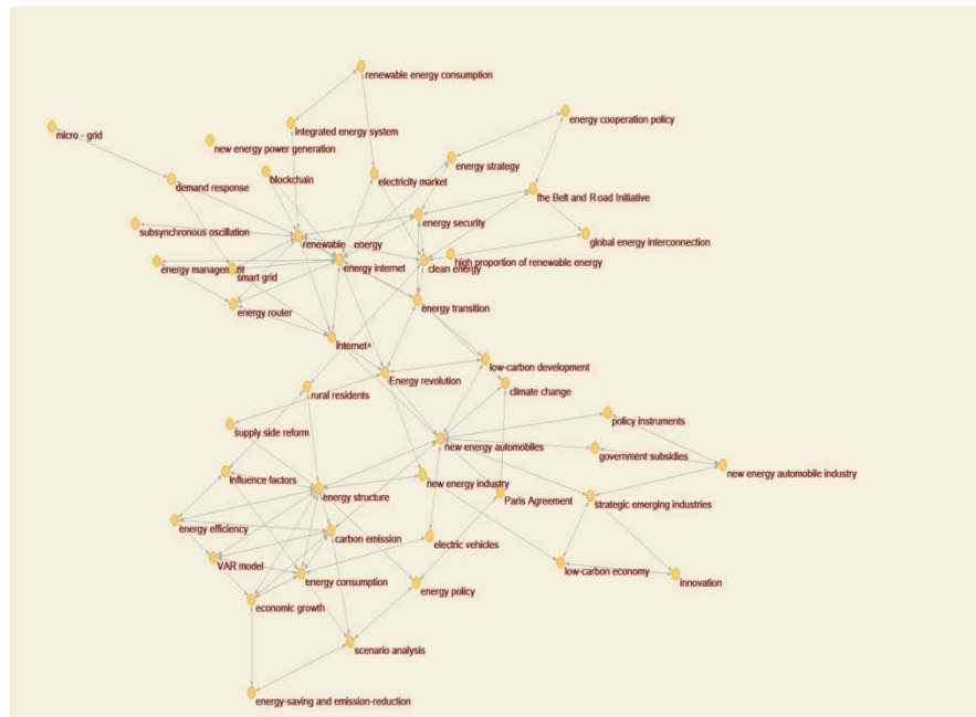
Figure 3. The keyword map for the new energy areas in 2017

orientations of the new energy in the year 2017, full characteristics of the studies are presented in the map, all of which can be divided into 5 clusters, including new energy automobiles, energy internet, renewable energy, energy structure and carbon emission.