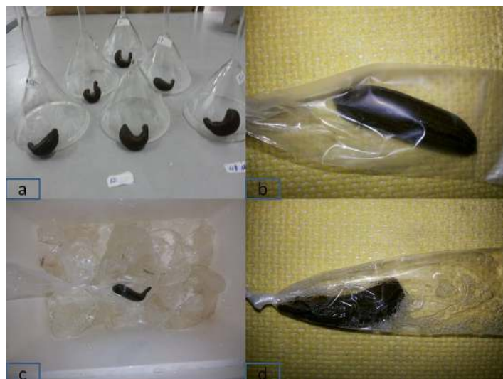
Figure 1. Leech saliva extraction method

Leech saliva was extracted by using a method used by Abdulkader et al. [6] without killing the leech. Leeches were fed a phagostimulatory solution made of a mixture of 0.001 M arginin and 0.15 M sodium chloride solution which was heated at 37°C [8]. This solution was placed in an inverted funnel coated with a parafilm sheet. Leeches were allowed to suck the solution through the parafilm until they were satiated and detached themselves from the parafilm (Figure 1a). The weight of leeches before and after sucking the phagostimulatory solution was recorded.