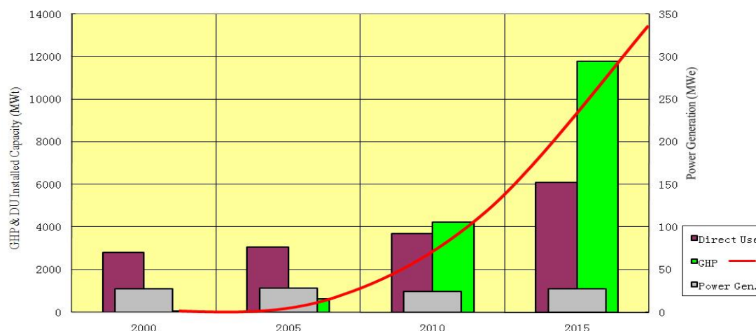
Fig. 1. Comparison of growth of GSHP, geothermal direct use and power generation in China