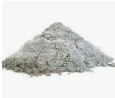
Figure 1. Raw Fly Ash

Eggshells powder: Eggshells are waste product produced by the food industry in restaurants, poultry farms and bakery shops [9]. The raw eggshells were dried by oven for 24 hours at 110^\circ\text{C} . The dried eggshell shells then were ground to finer particle <60\mu\text{m} that fulfill the requirement of ASTM C618-12 [13]. Table 2 and Figure 2 shows the ground eggshells and the chemical composition of the eggshells. The coarse aggregate used are crushed granite from a quarry in Panching, Pahang while the fine aggregate are river sand from Kuantan River.