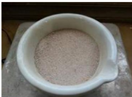
Figure 2. Ground Eggshell Powder