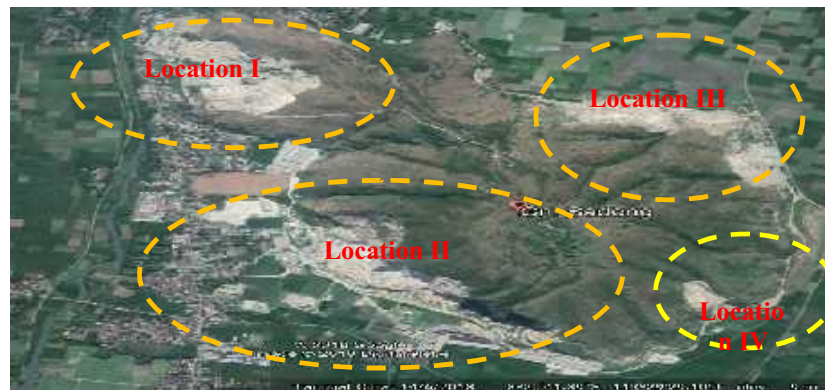
Figure 1. Location Changes Landscape Karst Mountain Sadeng

The heaviest damage in the field occurred in locations I and II. Both locations are industrial estates with large scale cement plants. While locations III and IV the damage level is still small. This condition is inseparable from traditional mining activities carried out by residents living in four villages including grenden, kasiyan, puger kulon, and puger wetan.