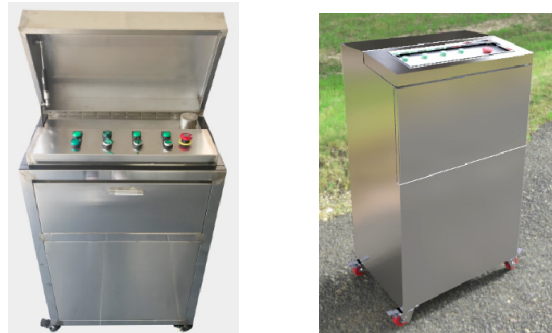
Fig. 1: Structural diagram of DT-12-01 intelligent biological deodorizer

rationing tank, tap-water filter and mixing tank, among which there are three solenoids and four sensors. High-pressure spraying system is mainly composed of motor, high-pressure pump, high-pressure pipes, high-pressure nozzles, etc. The specific structural details are shown in Figure 2.