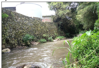
a) Site 1