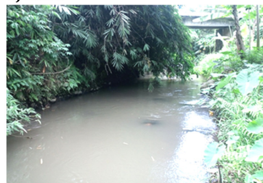
Figure 1. Sampling sites in the Cokro River, Malang Regency (Fig. 1a, 1b, and 1c are Site 1, Site 2 and Site 3, respectively)

The temperature, pH of bottom sediment, pH of water, current speed, water depth and dissolved oxygen in each sampling sites in the Cokro River were investigated (Table 1). The temperatures of the river water ranged between 22.5-23.07 °C. The pH of the bottom sediment and water ranged between 4.1-4.8 and 7.1-7.2, respectively. The current speed of the water flow in this river ranged from 0.4 m/s until 0.6 m/s. The water depth of the sampling sites in this study range between 41.8-52.8 cm. The dissolved oxygen range from 11.9 to 12.3 mg/L. The characteristics of the sampling sites in this study are generally almost the same. The parameters those mostly different among the sampling sites are the current speed and the river depth.