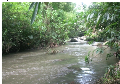
b) Site 2