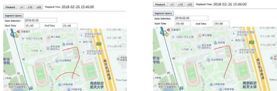
Figure 7 & 8. Examples of the segment query and conflict.