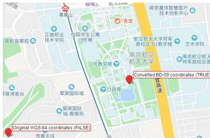
Figure 1. Coordinate conversion example

that can be shared by numerous users. The users need to have a receiving device, which can receive, track, transform and measure the positioning signal in order to use the positioning signal. Chinese self-developed global satellite navigation system is called BeiDou satellite navigation system. As of November 19, 2018, a total of 43 BeiDou navigation satellites has been launched.