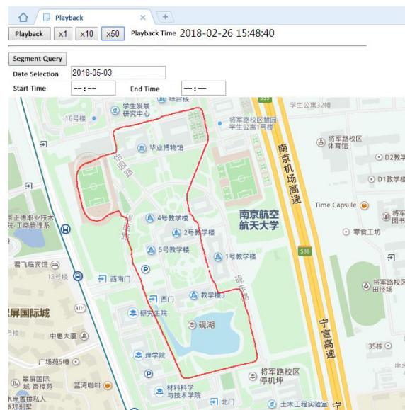
Figure 6. Track playback web page effect.

The final website realizes the function of track playback through the interaction with the background database. Figure 6 shows part of the interface effect of the track playback.