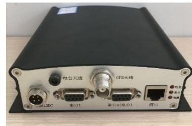
Figure 3 & 4. Positioning receiver and antenna

In the software part, the software architecture is divided into display level, business level and data level [4] . In the presentation level, HTML5 is used to build the web page layout, and the web behavior layer is completed based on the Baidu JavaScript API. In the business level, using the object-oriented C# language with the Visual Studio 2017 development environment, an .exe application is built to receive the positioning statement from the serial port from the receiving equipment. Whenever a positioning statement is received, the C# program will immediately process it according to the mathematical logic and store the processed data in the database. In the data level, the SQL Server database as a data management system is an essential back-end support.