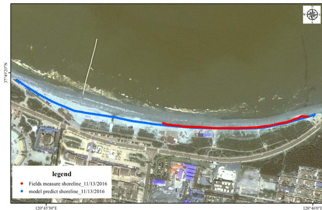
Figure 5. Validated the prediction results by using fields' measure shoreline data in 13 November 2016