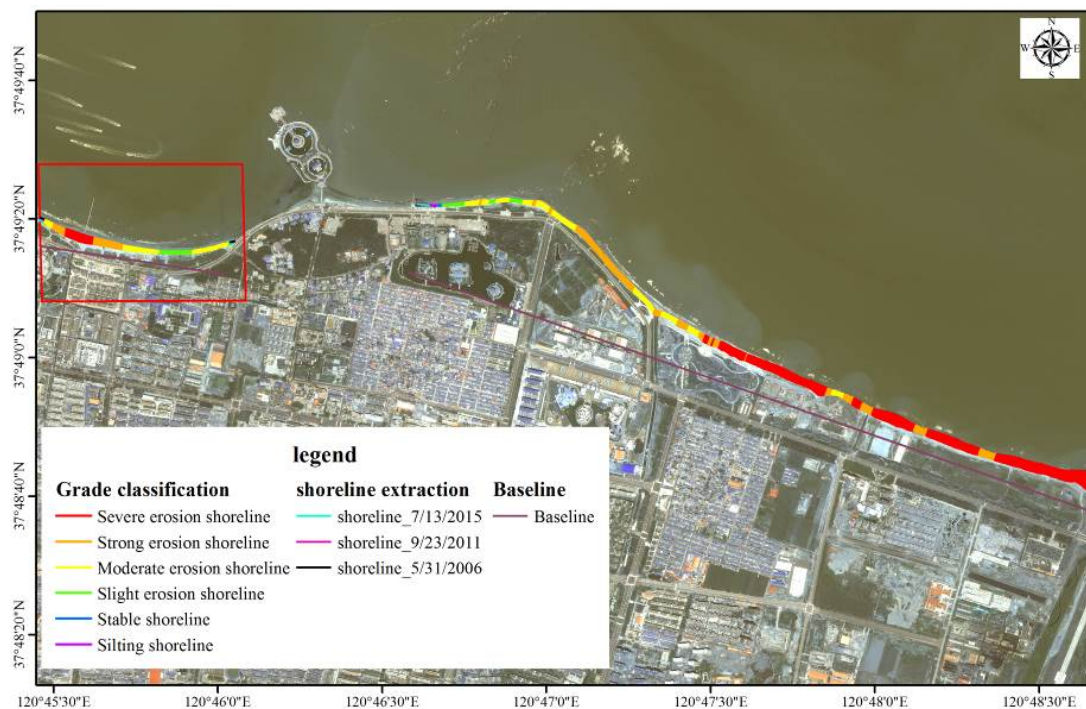
Figure 3. the spatial distribution of the shoreline variation rate of the coastal erosion of the Penglai sandy coast in the 2006 ~2015 years

The spatial distribution of the erosion intensity of the monitoring shore between 2006 and 2015 were obtained From Fig. 3.