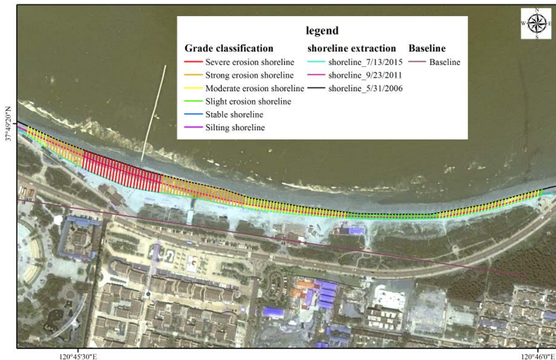
Figure 4. A larger picture of the red box in Figure. 3