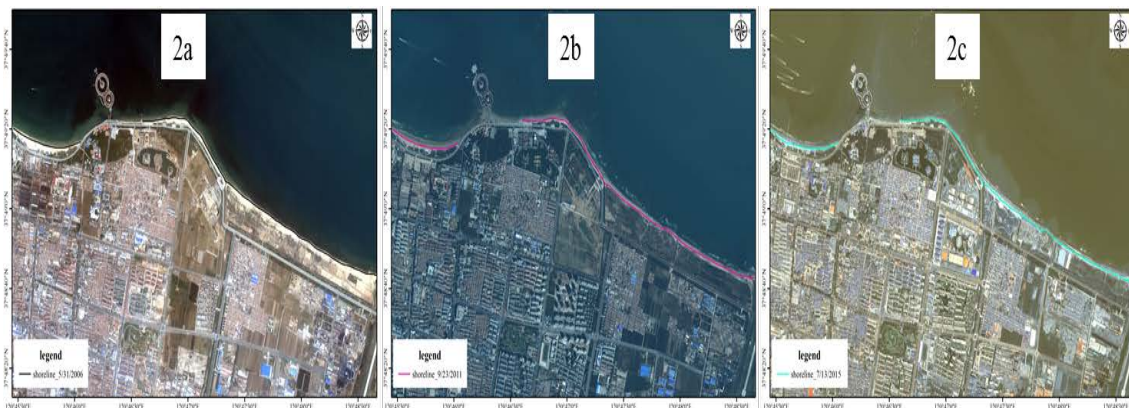
Figure 2. Remote sensing image and shoreline extraction of Penglai monitoring coast in three different periods