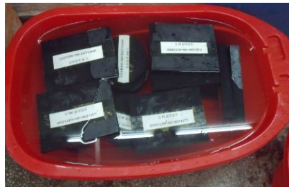
Figure 1. Shape of a test specimen