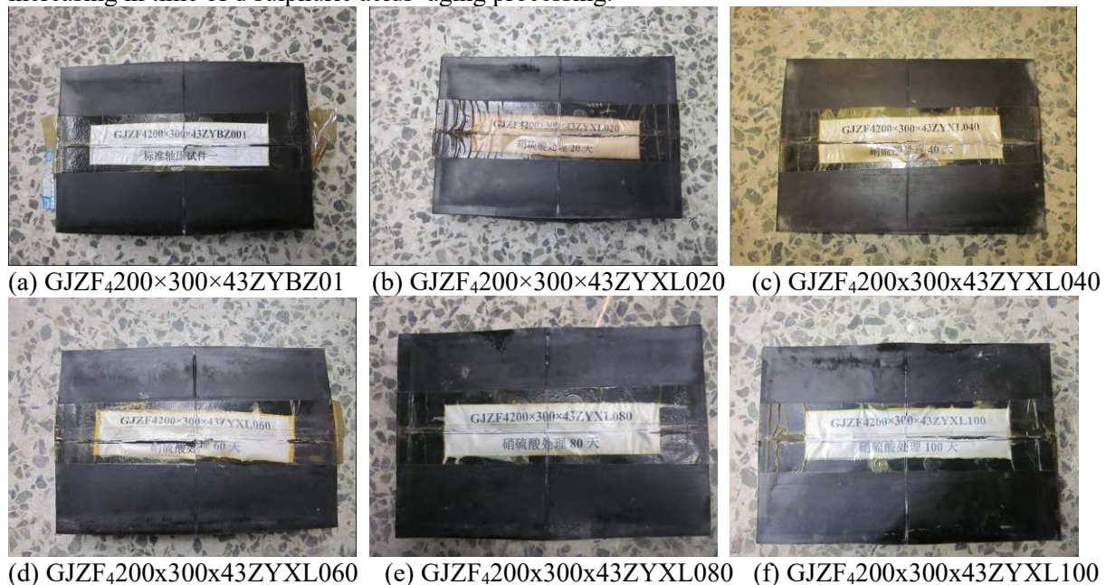
Figure 3. Failure modes of specimens

The mechanical properties of specimens are shown in table 3. The compressive capacity, ultimate compressive strength and compressive elastic modulus of the specimens decreased obviously with the increasing in time of sulphuric acids aging processing.