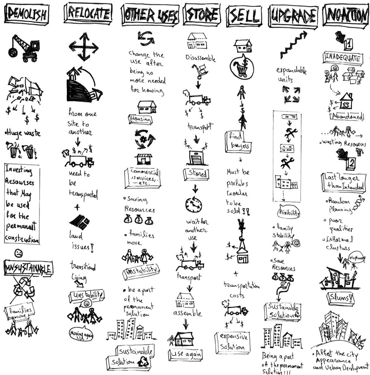
Figure 1. Temporary housing usual destinies. Figure by: Rand Askar.

after their displacement to regain their stability and comfort in order to get over their trauma and move forward with their normal lives and practices [2].