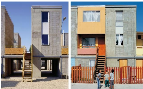
Figure 3. Quinta Monroy before and after resident's additions.