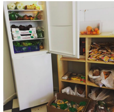
Figure 3. Also, on Instagram, informing that the solidary fridge in Majorna is full.

The Fixoteks have already helped spread sustainable consumption practices. It has been easier to get working in Majorna, where the population seemed already to understand the concept with little need for explanation. Interesting to note, that Majorna is the highest income area out of the four centers. Project staff have had to explain often in the other three locations, that they do not repair things for the neighbors, but rather provide the space, tools and assistance for them to do it themselves. However, a deeper understanding of the context in all locations is needed to better communicate and engage with the local communities. This will hopefully be possible by analyzing all the data collected during the test period.