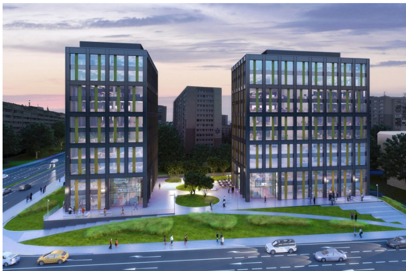
Figure 2. Duett Business Residence visualization.

twelve floors. Underground floors are used for parking and a business unit; the aboveground floors are used for renting office space. Aboveground floors consist of two separate towers of the Duett I tower and the Duett II tower. The underground floors are constructively designed as a white bath as an object formed by two dilation units located on a common undiluted base plate. The roofs of the two height parts of the tower Duett I and Duett II are designed as flat, partly sloping roofs.