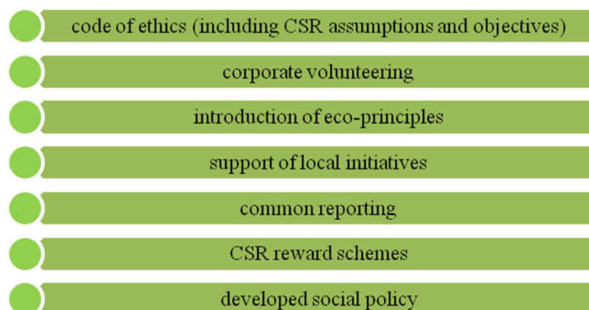
Figure 2. Tools for CSR incorporation into the corporate culture

However, to be able to speak of effects, it is essential to focus on tools used for efficient incorporation of the CSR principles into the long-term and current operations of the corporation. Figure 2 presents basic tools that - according to the authors - may contribute to the integration of the corporate culture into CSR in the companies. The list of tools has been separated by the Authors based on observations and direct conversations with employees of companies associated with the energy industry, especially representatives of middle management