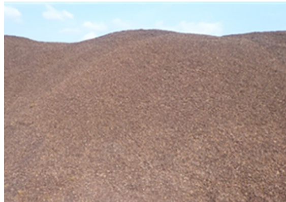
Figure 1. Oil palm shell disposal area.

Ordinary Portland cement (OPC) complying to ASTM C150 [23] was used as the binder. River sand from a single source was used as fine aggregate. Supplied tap water was used for concrete preparation and curing. Oil palm shells were collected from dumping area in the area of palm oil mill as illustrated in Fig. 1. The oil palm shells used is produced from palm oil tree of Dura species. Oil palm shells were cleaned to ensure it is free from debris. Then it is oven dried before kept in a closed container. Cockle shells shown in Fig. 2 were obtained from the dumping area nearby cockle processing location. Then, the shells were washed to remove the sands and dirt on its surface. Then it was dried before crushed into fine particles.