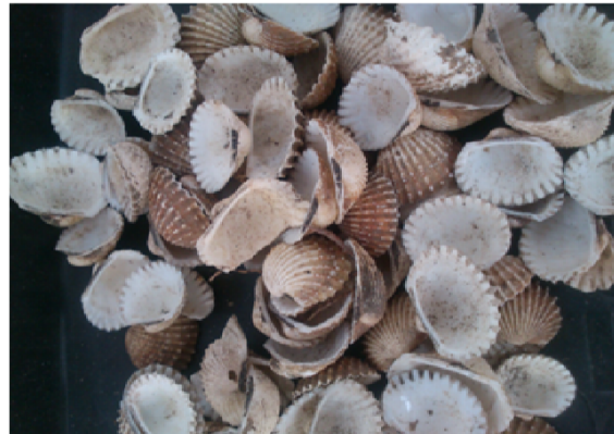
Figure 2. Cockle shell.