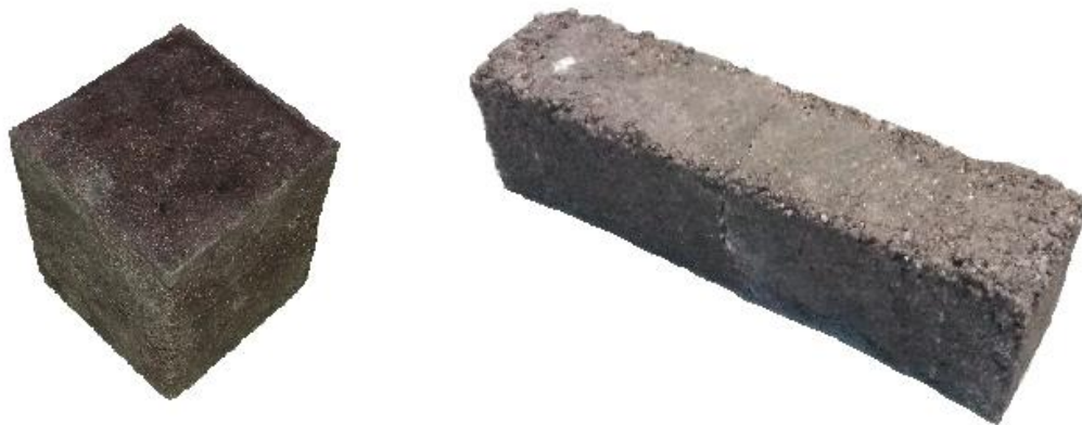
Figure 1. Waste plastic-based concrete samples.

The samples were made of fine aggregate (aggregate size 0 - 4 mm) and waste PET which was cut into small pieces. The production consists in homogenizing the mixture of plastic waste and fine aggregate in the weight ratio of 23:77 at high temperature. At first, the aggregate was heated up to a temperature of about 430 °C. After that, the PET waste was added to the aggregate and melted. After mixing the two components, the temperature decreased, and the mixture was homogenized. Optimal workability of the mixture was reached at about 310 °C, when the consistency of the mixture was viscous. Then, the mixture was placed into the prepared forms. The forms were pre-heated to eliminate the thermal shock which could cause a surface disruption of the samples. After that, the moulds with the mixture were left at room temperature and after cooling, the samples were removed from the moulds. Overall, eight samples were made, four samples were cube shaped and four samples were beam shaped. The dimensions of cube shaped samples were 100 x 100 x 100 mm and the dimensions of beam shaped samples were 50 x 50 x 200 mm (figure 1).