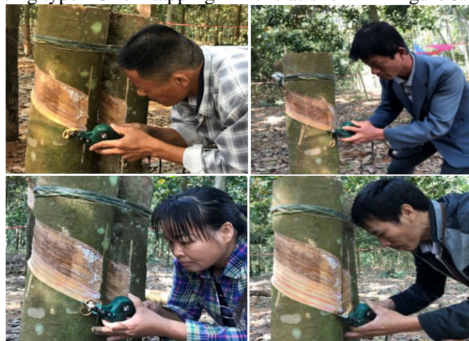
Figure 5. The workers practice using type 4GXJ-I tapping knife

The workers practice using type 4GXJ-I tapping knife is as shown in Figure 5.