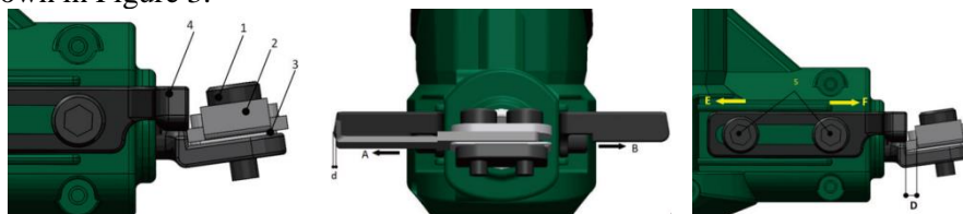
Figure 3. Adjustable cutting unit of type 4GXJ-I tapping knife

Key techniques for application include adjustment of the bark consumption, adjustment of cutting depth and adjustment of the width of the junk slot. Adjustable cutting unit of type 4GXJ-I tapping knife is as shown in Figure 3.