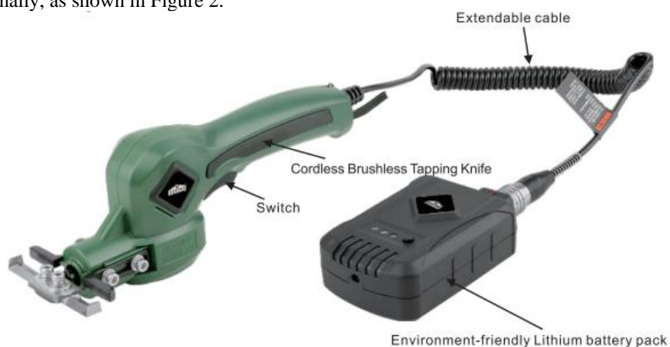
Figure 2. Type 4GXJ-I of cordless brushless tapping knife

2.2. The molded type 4GXJ-I tapping knife. A lot of modification and checks have been made for the tapping knife. The knife is becoming a practical useful tapping tools. Type 4GXJ-I tapping knife is molded finally, as shown in Figure 2.