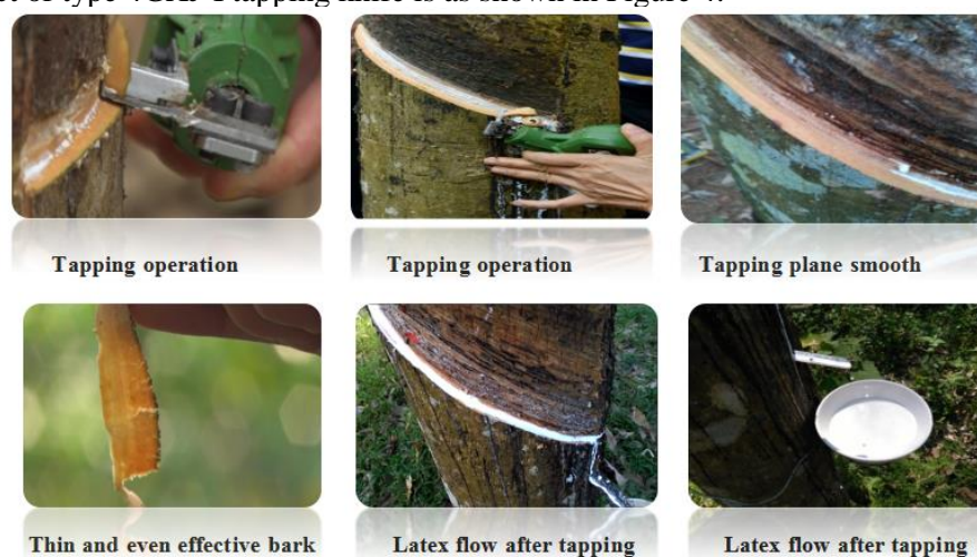
Figure 4. Tapping effect of type 4GXJ-I tapping knife

Tapping effect of type 4GXJ-I tapping knife is as shown in Figure 4.