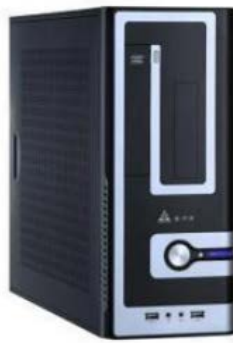
Figure 1. Small electronic instrument modeling

The linear geometry has a solemn, uniform, calm, and serious feeling, and the processing process is relatively simple, but this modeling is rigid and monotonous. Therefore, in the linear treatment, the use of round corner transition, causing movement in the quiet, to the linear line appears lively and changeable; this has become the mainstream of the contemporary horizontal box modeling.