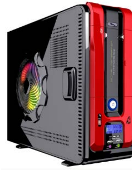
Figure 2. Current small instrument modeling

Figure 2 shows the current popular small instrument modeling. The modeling of the medium-sized horizontal box is also basically a rectangular body. It is also the most convenient means to obtain a concise modeling. Of course, this modeling is based on the function of the box itself.