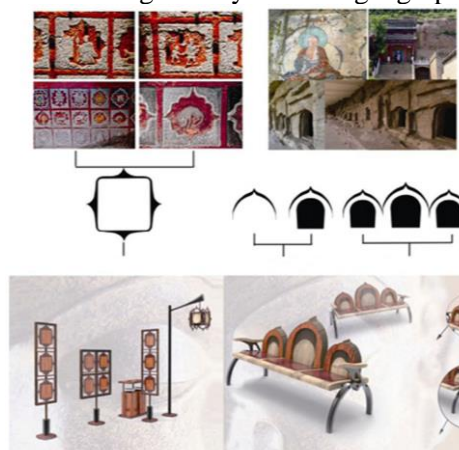
Figure 1. Case Study of Cultural and Creative Products in Yiju Temple

Secondly, the extraction of regional culture should follow the principle of reconstruction, and adopts design methodologies including appropriate forms, deformations, dislocations and metaphors to analyze and reconstruct the cultural symbols. In the process of transforming specific regional cultural symbols to the abstract design symbols, the procedures of extracting classic symbols, optimizing the abstraction of symbols and reconstructing the symbols, so as to realize the artistry of the symbols and realize the reconstruction and sublimation of the symbols. For example, picture 2 shows the design case of the public chair design in American Grand Canyon Area. Because American Indian culture is generated here, and the railway has played important role in the western development in American history. To maximize the historical background of the region and the unique geographical culture, the designer utilizes the reconstruction principle in the geographical cultural symbols to reflect the hidden culture in the public chairs. The design approaches enable the communication between the product and the user, and highlight the historical meaning conveyed in the geographical cultural symbols.