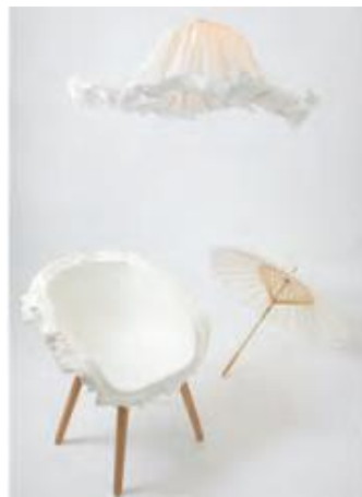
Figure 4. The future of Yuhang paper umbrella exhibition

Picture 5 below is the innovative design of red clay exorcising dance pottery. It uses Zhanjiang red exorcising dance as the classic representative of regional cultural symbol. Through processing the cultural symbols, the signals including the design modelling, pattern, ornamentation and color are converted into design element to achieve the regional culture feature that the product wishes to convey. Another example in picture 6 is the design of tea set of swimming fish in clear water. The swimming fish, sea and the wave on the surface of the water are used as the design elements by the designer. With the combination of product and sea culture, the distinctive and rich ocean culture features are reflected. The two cultural and creative products in picture 5 and picture 6 are used properly in the culture and creative products, which accurately demonstrate exorcising culture and sea culture. It is shown that reflecting regional cultural features can accurately and effectively demonstrate local features, highlight the characteristics of cultural and creative products, and improve the product’s cultural taste.