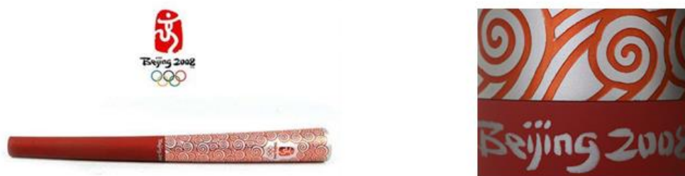
Figure 3. The design of Olympic Torch