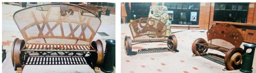
Figure 2. Design of Cultural and Creative Public Seats in the Grand Canyon Area of the United States