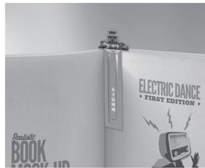
Figure 7. The Pearl form of earphone Figure 8. Oriental Salt Lake City Bookmark Form