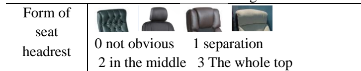
Table 1. Part of the classification variable gene induction table.

In the product gene network, the edge between gene nodes is the topological expression of the correlation between genes, that is, the existence of the edge between nodes means that the connected gene nodes have certain connections. The calculation of correlation between genes requires the numerical value of morphological gene coding and the retrograde calculation. For continuous genes, Pearson correlation coefficient was adopted for calculation, and Spearson correlation coefficient was adopted for calculation of genotype genes and the cross calculation of two genes. After the calculation is completed, the edges of the gene network under the corresponding threshold can be obtained by taking different thresholds.