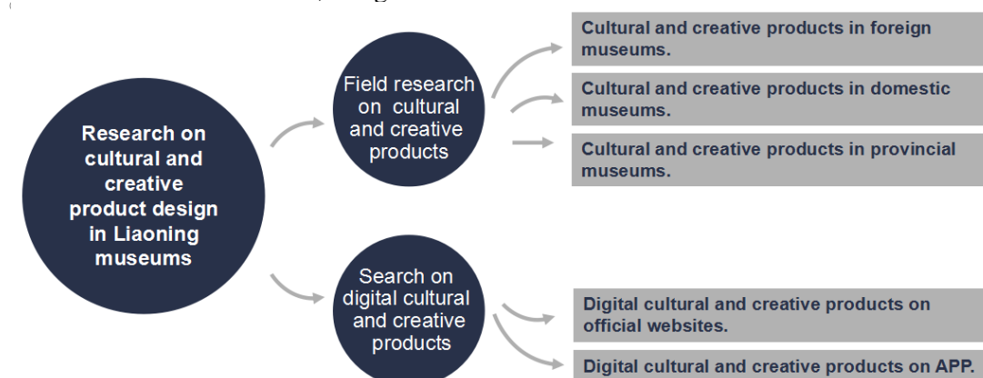
Figure 1. Classification of cultural and creative products in Liaoning Museums