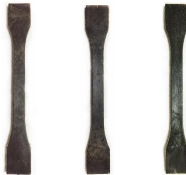
Figure 4. PLA and tea waste composite samples.