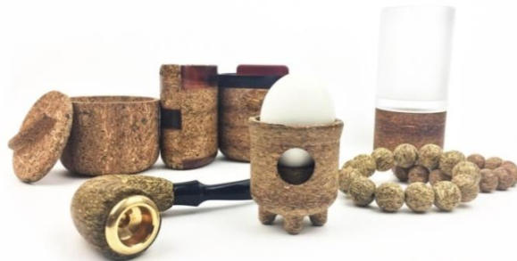
Figure 1. "CHAMU" reprocessed products.

In past experiments, the authors used the characteristics of tea stems rich in plant fibers in tea waste and prepared an artificial board based on tea stems by using a high-temperature hot pressing process (as shown in Figure 2).