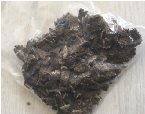
Figure 3. PLA and tea waste composite.