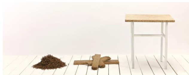
Figure 2. "CHAMU" artificial board.

Through the mechanical testing machine test, as shown in Table 1, the mechanical indicators are in line with national standards [6] .