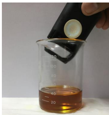
Figure 1. Spectra acquisition using portable spectrometer

The materials used in this research are 30 samples of patchouli oil that obtained from different regions in Indonesia (Konawe, Kolaka and Masamba from Sulawesi island, Bogor, and Garut from west java and Aceh and Jambi from Sumatra). Instrument used in this study was a portable spectrometer SCiO by Consumer Physics (wave length 760-1050 nm) that used for measuring wave spectrum of patchouli oil samples, liquid scan accessory used as a tool for laying the portable spectrometer when the measuring in order to avoid the sink of SciO sensor in the oil. GC-MS was utilized to determine the content of clove oil. Furthermore, the software used in this research is SCiO Lab: Developer Toolkit , Octave-4.2.1 , The Unscrambler X 10.4 , dan Microsoft Office Excel . There are five steps of patchouli oil determination nondestructively using Near Infrared Spectroscopy ; (1) samples preparation, (2) Measurement using GC-MS, (3) wave spectrum data intake using NIR, (4) Pre-treatment data process, and (5) development of calibration and validation model.