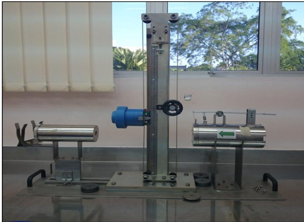
Figure 2. The Ludlum configuration used for the measurement of mass attenuation coefficient in the study.

where E_{\gamma} and E_{\gamma'} is the incident and scattered gamma energy respectively, \theta is the angle of scattered gamma and m is the electron rest mass [12]. This equation easily derived by assuming a relativistic collision between gamma ray and an electron initially at rest [6]. The calculated scattered gamma energies of the ^{137}\text{Cs} is presented in Table 2.