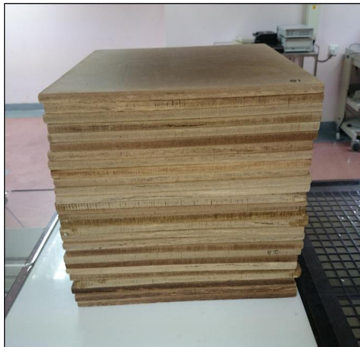
Figure 1. The fabricated Rhizophora spp. particleboards used in the study.

The fabricated Rhizophora spp. particleboards used in this study was based on the previous work by Mohd Yusof et al. [5] and Mohd Yusof et al. [11] as shown in Figure 1. The Rhizophora spp. particleboards were fabricated with the addition of tannin as adhesive material to increase their physical and mechanical properties [5]. Several evaluations on their physical properties including the percentage of elemental compositions, calculated effective density and effective atomic number were investigated and presented in Table 1. A previous work indicated the close values of mass attenuation coefficients of the particleboards to the values of water at ^{137}\text{Cs} and ^{60}\text{Co} gamma energies by using the transmission method [6]. Therefore, this study focused on the measurement of mass attenuation coefficients of the particleboards at scattered gamma energies of ^{137}\text{Cs} by using the Compton scattering method.