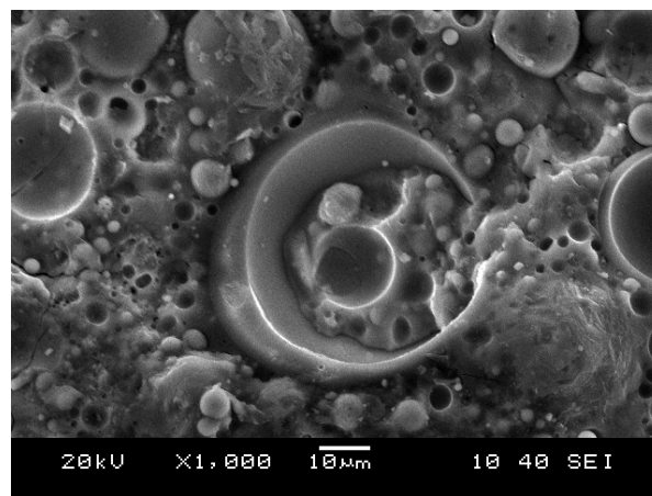
Figure 2. SEM micrograph of alkali activated fly ash particles.

Figure 2 displays the SEM micrograph of alkali activated fly ash particles. As compared to the fly ash micrograph in Figure 1, it could be observed that the surface of spherical fly ash particles opened up when the fly ash was mixed with the alkali activator. Fernandez-Jimenez et al. [17] reported that the dissolution process of Al and Si occurs when fly ash is added with alkali activator and followed by the condensation of higher molecules into a gel via nucleation and polymerisation. Then, the alkali attack opened up the spheres and exposed the internal small spheres. The small spheres inside would dissolve when in contact with alkali and the reaction products were formed inside and outside the sphere.