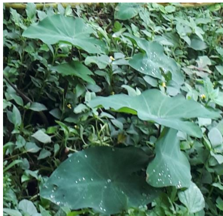
Figure 3. Velvet bean cultivated around organic rice field

Informant AM said that the organic farming practice includes water minimization due to soil conservation. The saving is not about the direct water consumption from rain water, but about how the water can be stored as long as possible in soil to fulfill the farming needs. The argumentation is also completed by SS after explaining about the phenomena of top soil crack. Before applying organic farming, SS used to experience top soil crack while still adopting the conventional farming. The rain water supply is not used optimally and just becoming run-off. When the rain was stopped for 1 weeks, the soil then dried out and ended to crop failure. Last but not least, AAS stated that the organic farming helps soil to maintain the water reserves. Also, AAS implicitly argued that organic farming will minimize the dangerous chemical expose through water. To sum up, the attribute value and sustainability value for this attribute are stated in Table 2.