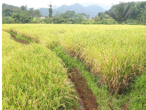
Figure 2. Organic rice field owned by SS in Sindangkerta Village

Considering the ontological reasoning developed in the previous section, this research is conducted as a case study in local society of Indonesia. Due to the limited organic rice farming in Indonesia, the organic rice farming considered in this research is purposively sampled. The case study is located at a 5000 m 2 rain-fed organic rice field in Sindangkerta Village, West Bandung Regency, West Java Province. The rice field is illustrated in Figure 2. The owner also as the farmer (name initial: SS) has run a fully-organic rice farming combined with System of Rice Intensification (SRI) since October 2007 under the guidance from Balai Besar Wilayah Sungai Citarum (BBWSC) and Agricultural Department of West Bandung Regency. This research is done within the period of October 2018 until March 2019. This is the period for the latest organic rice farming managed by SS in his farm. It includes the land preparation until the harvesting.