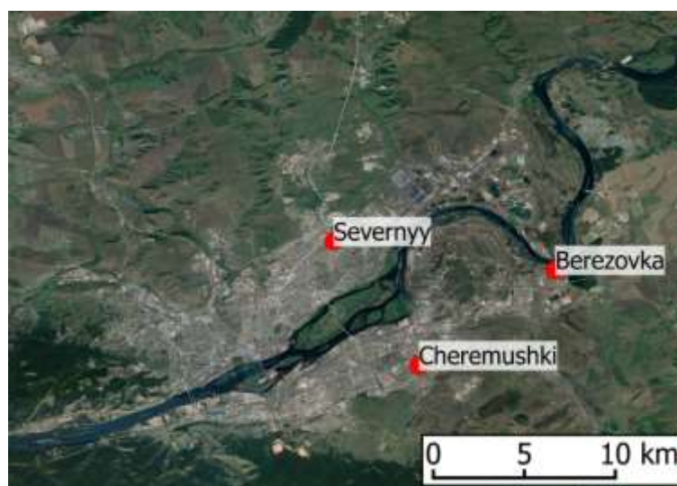
Figure 1. Location of monitoring posts in Krasnoyarsk used in the study.

In July 2018 PM 2.5 air monitoring in Krasnoyarsk was performed on three SOPs of the regional ecological system. Figure 1 shows the location of the SOPs from which data were used in our study.