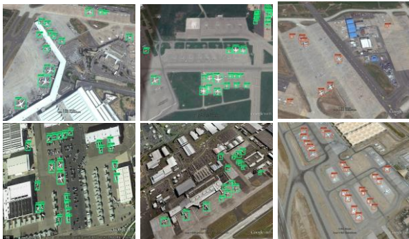
Figure 5. The detection results of Faster R-CNN