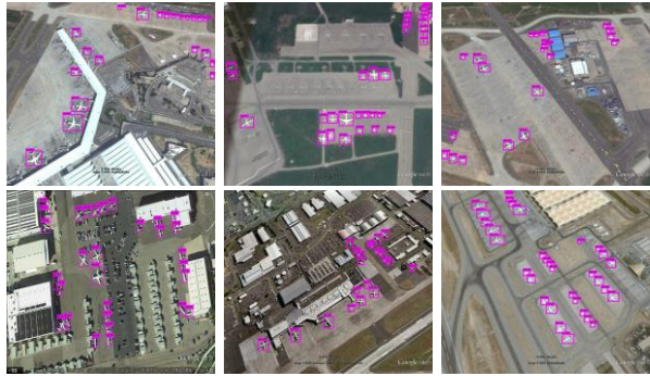
Figure 6. The detection results of YOLOv3

The corresponding AP value and detection time are shown in Table 3.