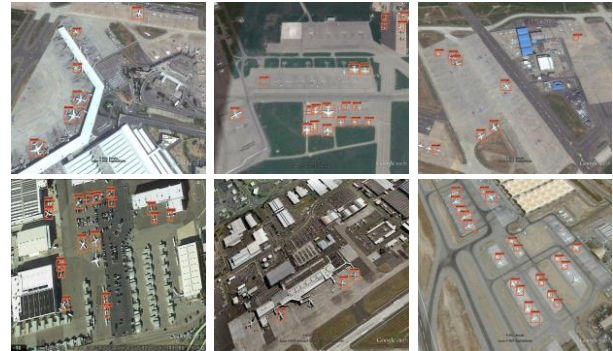
Figure 4. The detection results of SSD