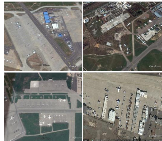
Figure 3. Some Samples of Experimental Data