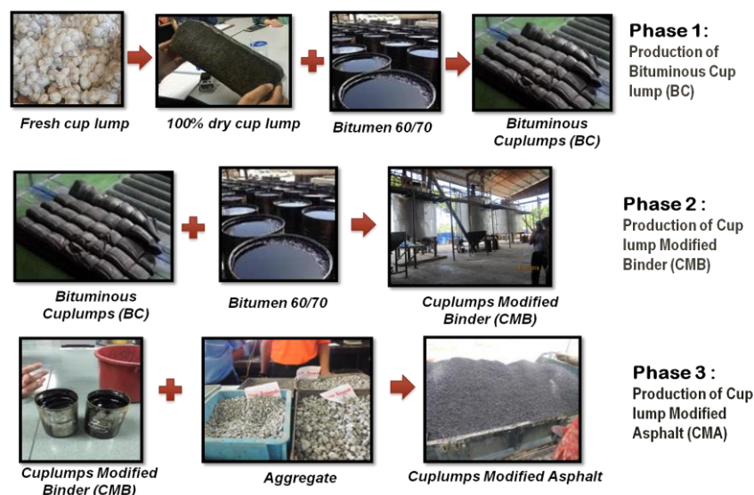
Figure 1. The procedure of Cup Lump Modified Asphalt (CMA).

The mixture of cup lump modified binder with aggregates will produce the Cup lump Modified Asphalt or CMA. Yearly, Public Works Department of Malaysia (JKR) spends on average of RM 3.9 billion on works related to state road maintenance of 197,000 km of existing roads throughout Malaysia in 2015 [10]. It is obvious that the government would make a considerable saving if the roads are durable and free from premature defects such as rutting and cracking. It is said that the service life of roads could be increased and their maintenance cost reduced by incorporating rubber in bituminous roads. This economical technique such as adding crumb rubber from a used tire and used glove has been reported to be proven effective and has been used for more than 25 years in the United States.