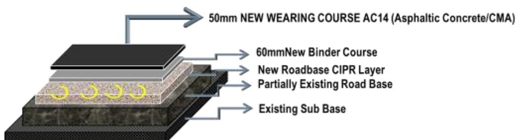
Figure 4. Structure of pavement layer.