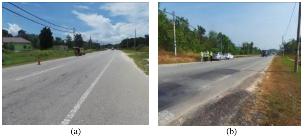
Figure 2. The condition of the existing road. (a) conventional asphalt section before construction and (b) cup lump modified asphalt section before construction.