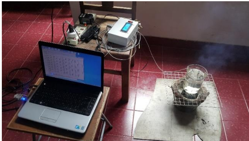
Figure 1. Primary experiment and measurement

Analysis by temperature measuring sensors connect to computer as shown in figure 1.