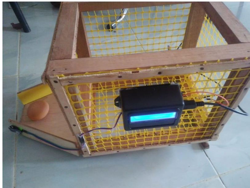
Figure 7. Final Prototype to measure the pawing frequency of laying hens.

This tool can be of great importance for poultry farms, since all these processes are carried out by many poultry farmers through the observation method, which can generate a lot of uncertainty. With this device you can make projections and draw conclusions about the behavior of the hens.