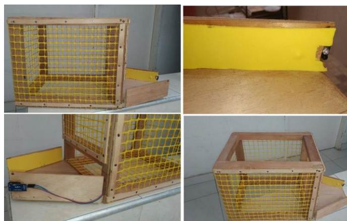
Figure 6. Electronic Module allows to measure the pawning frequency of laying hens.

For the development of the prototype, a scaled module cells were designed, to which a proximity sensor module (consisting of an infrared LED and a phototransistor) was adapted. This module fulfills the function of detecting the passage of the eggs deposited by the hen laying. The module cells are inclined at an angle of 30 degrees, making the eggs go down a ramp made of wood, passing through an area where the sensor is located, in which a beam of light is emitted and, if interrupted, a signal is sent. electrical signal to a microcontroller (Arduino Card), this system processes the information, then goes through a micro SD card module, which stores the data in a flat file of .txt format, later this information displayed on an LCD display, so that the Farmer poultryman can observe in real time the frequency of posture of the hen at any instant of time. In the figures 9 the final prototype is observed.