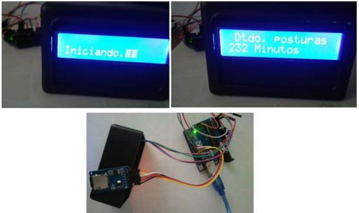
Figure 8. Technology used for final prototype

In the pilot tests of the prototype, the following technical characteristics were found, which are evidenced in Tables 1, 2 and 3. As future work, the investigation should be conducted in tests on poultry farms of the Department of Sucre.