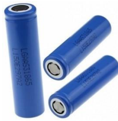
Figure 2. Lithium-ion battery