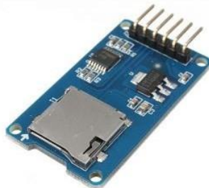
Figure 4. Module interface Micro SD Card

This device allows an SD memory card to be connected to a microcontroller, so that information can be stored. This is ideal for carrying out different types of projects.