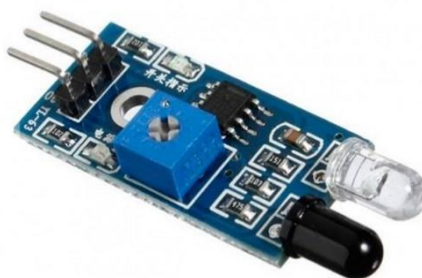
Figure 5. Infrared proximity sensor

It is a distance measurement sensor, which is based on a system of emission / reception of light radiation in the infrared spectrum [9].