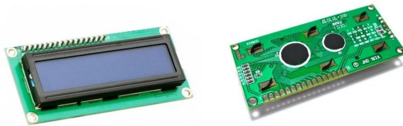
Figure 3. Display LCD

It is a passive display of low consumption, based on a substance trapped between two plates of glass. This electronic component serves to display messages by means of characters such as letters, numbers or symbols.