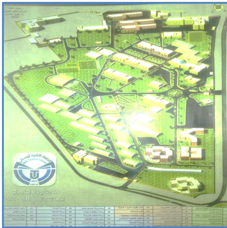
Figure 3. Map of Technology institute – Baghdad[23]