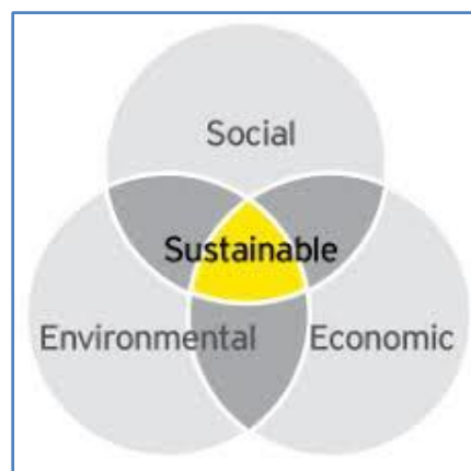
Figure 1. The triple bottom line (TBL) of sustainability [3].

The TBL aims to the integration among the three dimensions, taking into account that each of them is equally important.