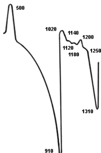
Figure 1. Thermogram of the raw material mixture «limestone – ore dressing waste».

The difference in crystalline structures of natural silicates and intermediate silica-containing phases predetermined the multi-stage bleaching with the predominant formation of C 2 S in the high-temperature region. The number of stages corresponds to the number of exothermic effects on the thermogram (figure 1).