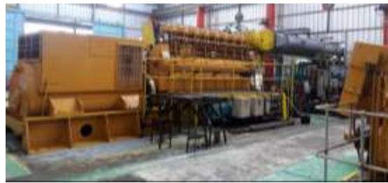
Figure 2. MAK Diesel Engine