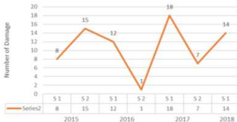
Figure 3. The number of damage of MAK engine from year 2015-2017

From the figure 3, we know that MAK engine damage occurred with fluctuating movement. The disturbances in term 1 in year 2018 occurred 14 times, in year 2017 occurred 18 times for term 1 and occurred 7 times for term 2, in year 2016 occurred 12 times for term 1 and occurred 1 times for term 2, and in year 2015 occurred 8 times for term 1 and occurred 15 times for term 2. Disturbance based on the FMEA at table 7 for the Merawang PLTD, maintenance will be prioritized on the 9 main causes with the most frequency. It concluded the 3 main causes of minor stops on the Merawang PLTD. There were 16 frequency head cylinder interference, 15 frequency interference valves, and 13 frequency nozzles. The most important damage that regularly occurred is the cylinder head leakage.