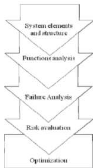
Figure 1. FMEA Research Methodology [6]

FMEA relies on a team-based analysis of risks of potential failures. The procedure of FMEA application includes [6] analysis of potential failure modes (function and failure analysis), identification of their possible effects (risk analysis) and causes and analysis of preventive actions used and actions for failures detection (optimization) as seen in figure 1.