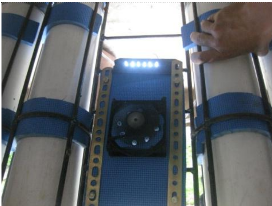
Figure 3. Testing with Light LED