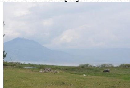
Figure 3. The abandoned land

The locals are not satisfied (Table 3, 2) and felt not facilitated by the government. However, according to the interviews with an academic, both the locals and government have been doing their best to prepare Situngkir. The problem is the lack of promotions or involvement of third parties. Also, this village