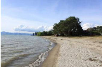
Figure 4. Natural attraction in Situngkir village

needed a background story of its own to make it even more meaningful to be visited. The packaging of a tourist attraction plays an important role in deciding the tourist destination as it can create a positive image, satisfaction, and loyalty of the tourists to revisit the place [19]. Tourists need more attractions while locals do not think so (Table 3, 3). The local community considers natural attraction (Figure 4) is enough to attract tourists while according to the tourists, other attractions such as cultural attractions, for example, should also be in the village. The development of tourism should be a comprehensive one such that it obtain optimal benefits for society, both in economic, social and cultural [20].