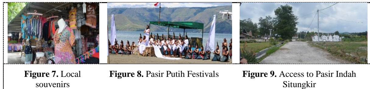
Figure 7. Local souvenirs