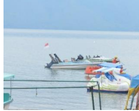
Figure 5. Artificial rides