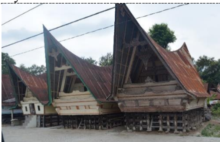
Figure 2. Rows of traditional houses

According to both locals and tourists (Table 3, 1), Situngkir village has implemented a development based on the local culture with the existence of rows of traditional Batakese houses (Figure 2). However, the row of traditional houses as observed, are still not well-maintained and not neatly arranged and looks dirty thus reducing the interest of tourists to explore further. The typical traditional houses need to be preserved regarding their patterns and custom settlements with the traditional aspects which is hereditary so that it does not reduce the authenticity of local cultural values [18].