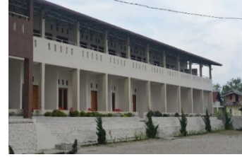
Figure 6. Hotel in Situngkir alongside the beach