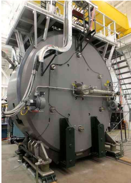
Fig. 1. MSU cyclotron gas-stopper Magnet as seen from the end.