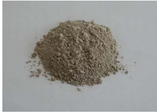
Figure 1. Photos of stoneware raw ore powder.