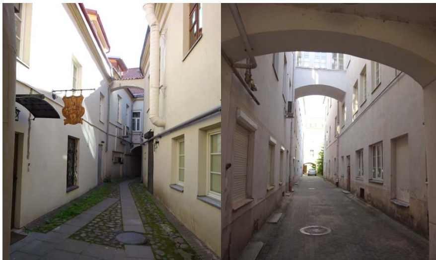
Figure 1. Pilies St. 8, Vilnius