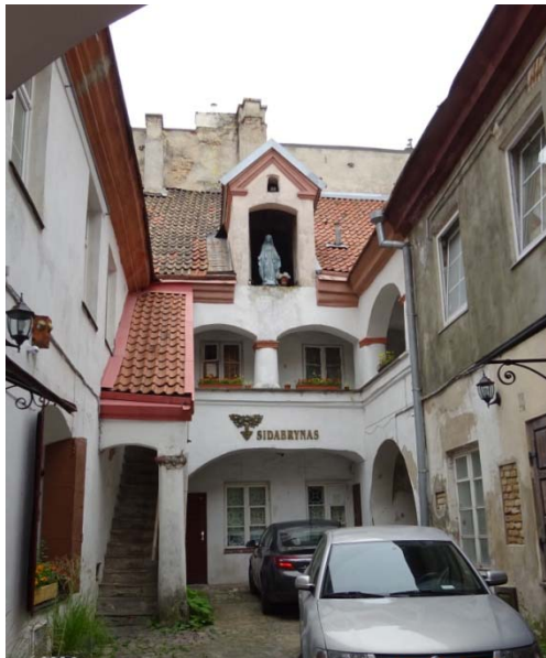
Figure 9. Pilies St. 32, Vilnius

teeming with life in the summer months, where the ground floors of buildings are occupied by numerous clubs and restaurants, and where small architecture, interesting architectural detail, or a strange wooden structure adjacent to a brick wall, foreign language inscription on the wall or hatch reminds of former residents. Less is happening in the Vilnius courtyards, rarely the ground floors of the buildings are adapted to the restaurants, equally rarely an interesting element that testifies for the multiculturalism of the city can be found. However, they are greener than the courtyards of Lodz, trees and green vines climb the walls of buildings and sometimes wooden galleries along the walls of the annexes give a special nature to these places. In each of these cities we can find very interesting backyards, different from all others. In Vilnius, it can be, for example, an inner-city, richly decorated courtyard with arcades, roof windows and an open staircase located at Pilies St. 32, (Figure 9). While, in Lodz, unheard of elsewhere, the courtyard at Piotrkowska Street 3, (Figure 10), where the walls of the tenement house and the annex were covered with pieces of mirrors, creating an amazing mosaic resembling tufts of flowers.