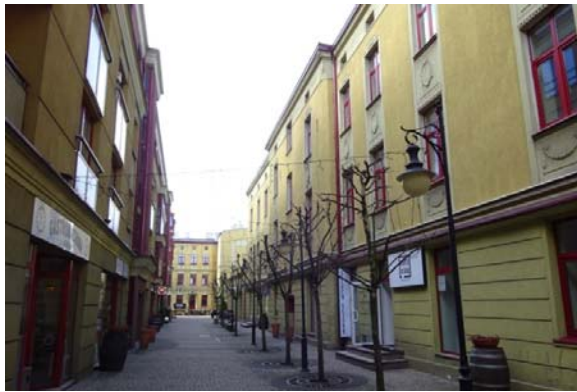
Figure 5. Piotrkowska St. 89, Lodz

want to stay there. In Vilnius, such courtyards appear at Pilies St.6, Stikluc St.7 or Sv. Kazimiero St.3, (Figure 6).