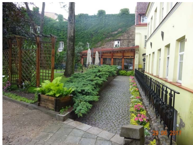
Figure 4. Ligones St. 7, Vilnius

In the inner city quadrants of both cities, a significant group of courtyards is created by those which have a closed arrangement. These are so called well-courtyards, which – in Lodz – are typically closed off by the tenement house and the annexes, whereas in Vilnius the space of one of the annexes is usually occupied by an outbuilding. Standing in one of them, one has the impression that time has stopped, not having changed a thing for many years. In Lodz, they can mainly be seen at Rewolucji 1905 r. St., Wschodnia St., and Jaracza St. In Vilnius, at Piliamo, Sodu and Sopeno Streets. At Piotrkowska Street 89 (Figure 5), Piotrkowska St.67, or Piotrkowska St.102 we can find enclosed well-kept courtyards, whose road surfaces and walls of the buildings have been renovated and additional services or gastronomic functions and more greenery make them recognizable, and people