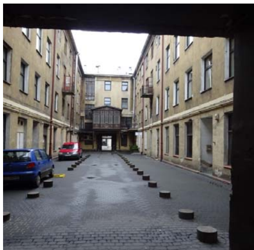
Figure 7. Piotrkowska St. 88, Lodz

The last type of courtyards, the least common in both cities, are the combined courtyards, which mostly have a open-closed arrangement that allows passage from one part to the other and exit to a completely different street. These yards, like the previous ones - mostly restored, often contain an interesting element or architectural detail reminiscent of the former residents of the city. Examples of such courtyards in Lodz are among others: the yard at Piotrkowska St.88 (Figure 7), in which an interesting wooden structure is hidden- a former Jewish sukkah, and also the courtyards at Piotrkowska St.80 and Piotrkowska St.90 or the courtyard at Próchnika St.10. The Vilnius examples include courtyards located at Saviciaus St.11, (Figure 8), Pilies St.38 and Basenevicas St.16a.