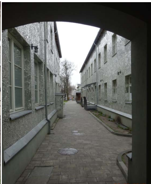
Figure 10. Piotrkowska St.3, Lodz