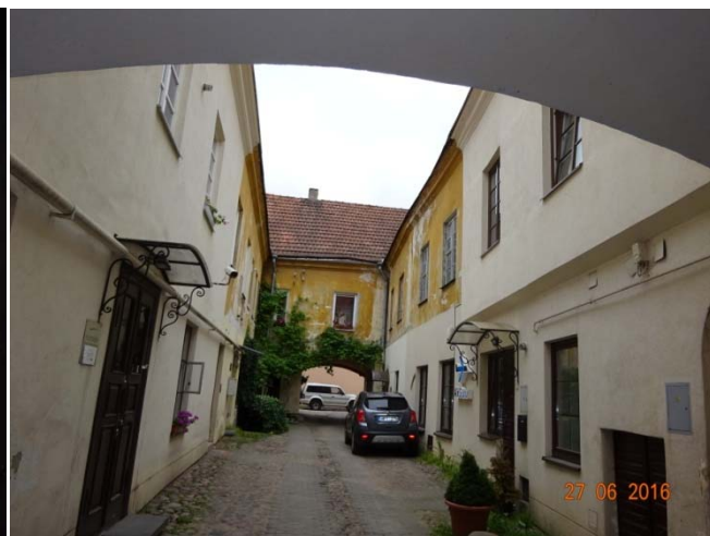
Figure 8. Saviciaus St. 11, Vilnius

Both the Vilnius and Lodz courtyards are connected with the fact that the facades of buildings surrounding the inner courtyards are usually devoid of architectural detail and are limited to inter-floor divisions and simple window frames. The main accent is the staircase division, which is usually closed in the result. Waste plasters from walls or damaged door and window joinery leaves a lot to be desired. The Lodz courtyards, unlike the Vilnius ones, are much more likely to attract, thanks to cognitive as well as occupational values, not only the residents, but also tourists. These are interesting courtyards,