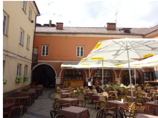
Figure 6. Sv. Kazimiero St. 3. Vilnius

The last type of courtyards, the least common in both cities, are the combined courtyards, which mostly have a open-closed arrangement that allows passage from one part to the other and exit to a completely different street. These yards, like the previous ones - mostly restored, often contain an interesting element or architectural detail reminiscent of the former residents of the city. Examples of such courtyards in Lodz are among others: the yard at Piotrkowska St.88 (Figure 7), in which an interesting wooden structure is hidden- a former Jewish sukkah, and also the courtyards at Piotrkowska St.80 and Piotrkowska St.90 or the courtyard at Próchnika St.10. The Vilnius examples include courtyards located at Saviciaus St.11, (Figure 8), Pilies St.38 and Basenevicas St.16a.