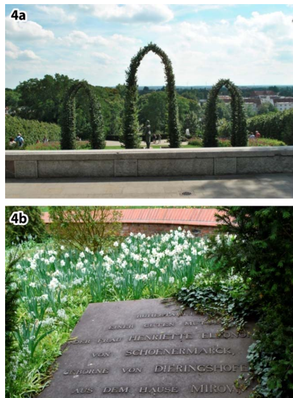
Figure 4 a) The motive of pointed arch made of plants, Brandenburg an der Havel. By A. Wójcik-Popek, 2015, b) New arrangement of Alten Domfriedhof (Old cathedral cemetery), Havelberg. By A. Wójcik-Popek, 2017