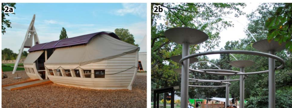
Figure 2a) Boat chapel, Brandenburg an der Havel. By A. Wójcik-Popek, 2015, b) The motive of Water of Life, Christian garden 'Paths of Life', Hamburg. By A. Wójcik-Popek, 2013

2. Chapels are more common in the exhibition landscape. They were present in 5 exhibition areas at the time of field research. The chapel in Ronneburg located on a spoil pile, becomes important sign in the landscape, overlooking the neighbourhood (Figure 1b). Chapels present in the different areas of BUGA 2015 Havelregion exhibition was deprived of vast landscape context. Their forms and symbols are also typical to Christianity (boat, cross) (Figure 2a) [23].