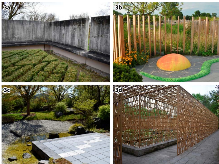
Figure 3 a) The Garden of Reflection referring to the Hortus conclusus tradition, Magdeburg. By A. Wójcik-Popek, 2017, b) Eden Garden, Brandenburg an der Havel. By A. Wójcik-Popek, 2015, c) Japanese garden referring to ancient Taketori Tale, Rostock. By A. Wójcik-Popek, 2017 d) Christian Garden, referring to mediaeval cloister gardens, Berlin. By A. Wójcik-Popek, 2017.